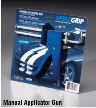
Manual Applicator Gun